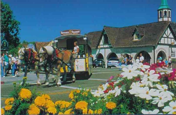
SantaBarbara.com Visitors Guide