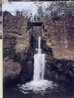
SantaBarbara.com Visitors Guide