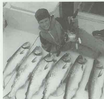
Kids learn how to fish